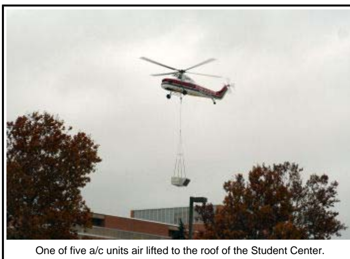
One of five a/c units air lifted to the roof of the Student Center.

On November 20, 2007, SIUC Construction Management hired St. Louis Helicopter Service to lift and set five air conditioning units on the roof of the Student Center. The helicopter was utilized in lieu of a crane, since a crane did not have