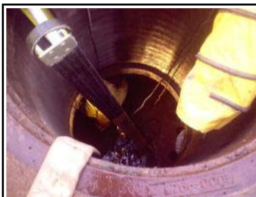
Electricians in an underground manhole behind the Physical Plant work to restore power. (Wed, 3/19/08)

A tent was placed around the manhole where the high voltage electrical line was being repaired. The incessant rain and wind created extreme working conditions.